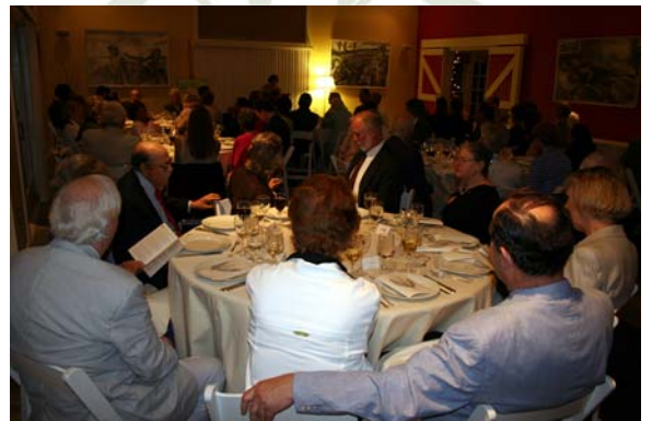
The Education Building is the site for all indoor events