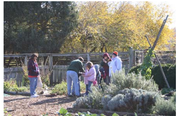
A school tour explores the Museum Garden